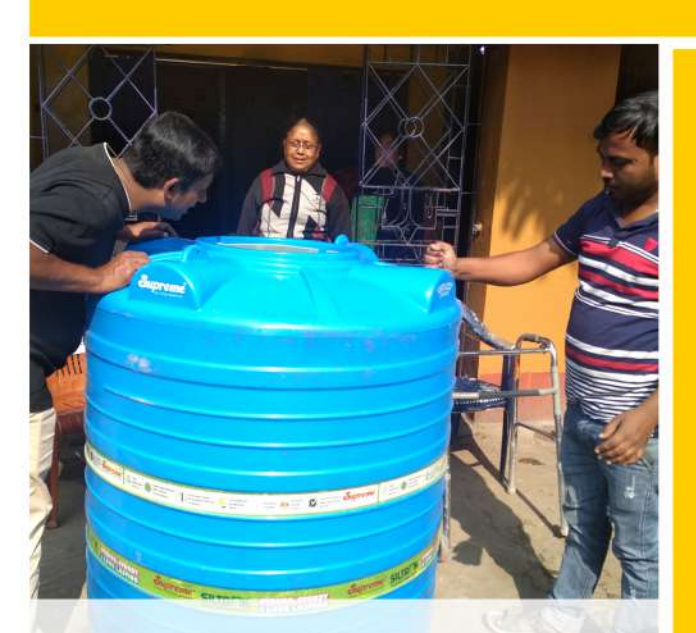
This tank was recieved in donation from "DAKHINER BARANDA GROUP"

Medical Van: The second hand Tata Sumo van, which got donated to FOKE through a gift deed by CRDS facilitated by Friends of Calcutta (FOC), served us well for the last few years. Both FOC and FOKE used the car for medical purposes. However, because of its lifespan of 15 years it became difficult to maintain. The expenses incurred for maintenance was becoming an extra financial burden on FOKE. There were safety issues too. Hence, it was decided by the Committee, that the vehicle would be handed over / returned to FOC through a gift deed.