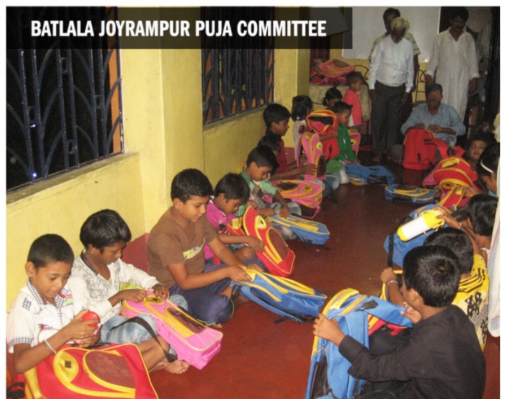
BATLALA JOYRAMPUR PUJA COMMITTEE