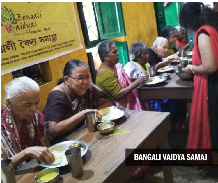
BANGALI VAIDYA SAMAJ