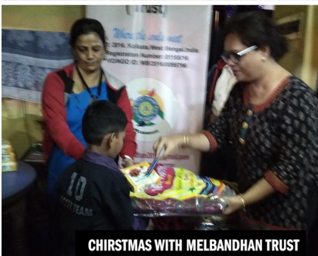
CHRISTMAS WITH MELBANDHAN TRUST