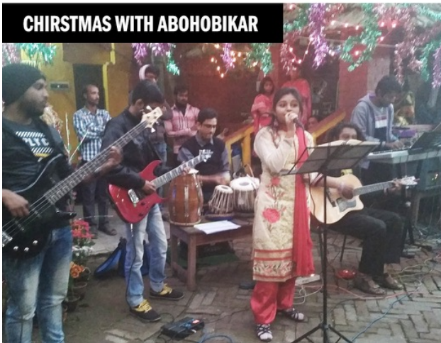
CHRISTMAS WITH ABOHOBIKAR